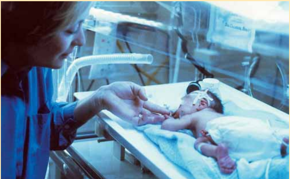
Photo 1: You can still bond with your baby even though he or she is ill