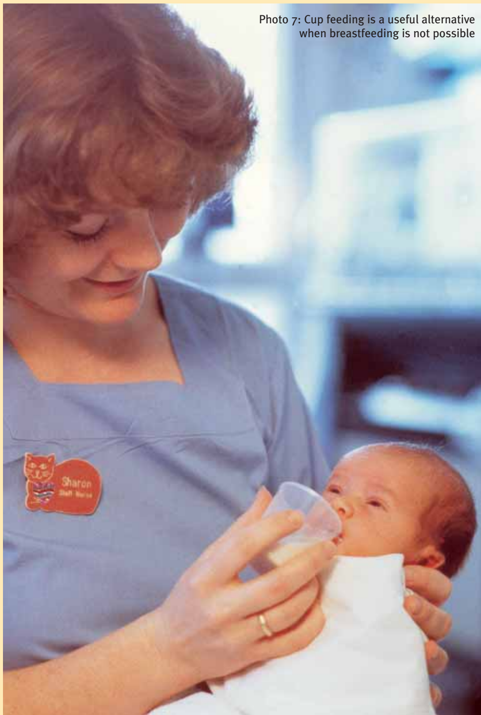
Photo 7: Cup feeding is a useful alternative when breastfeeding is not possible